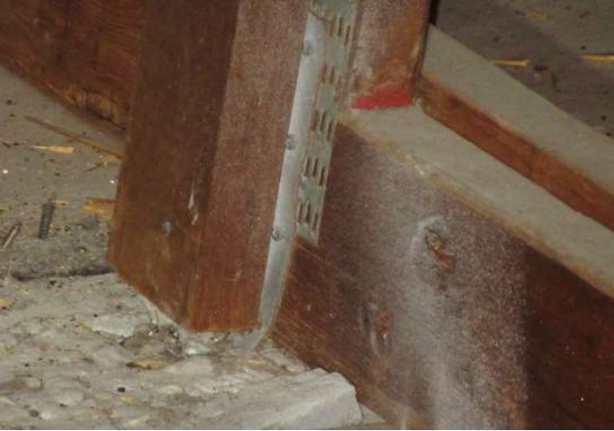
Single strap with at least 3 nails into the truss