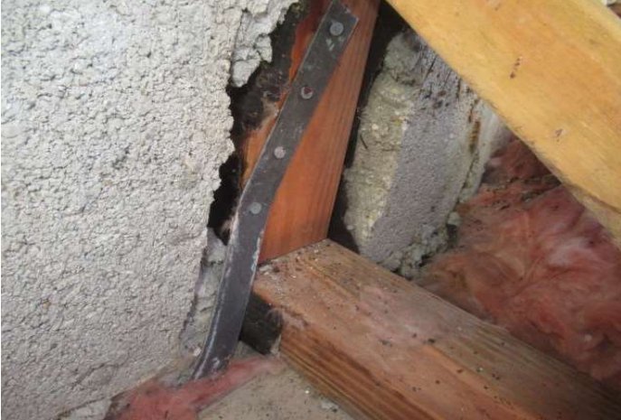
Single strap with at least 3 nails into the truss