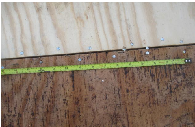
6" spacing in the field