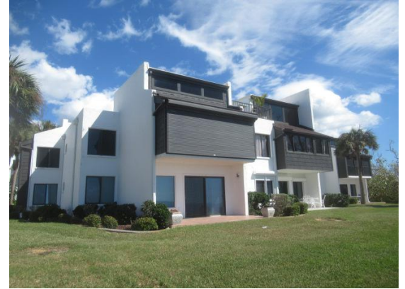
8d nails used on all Tamarind roof decks